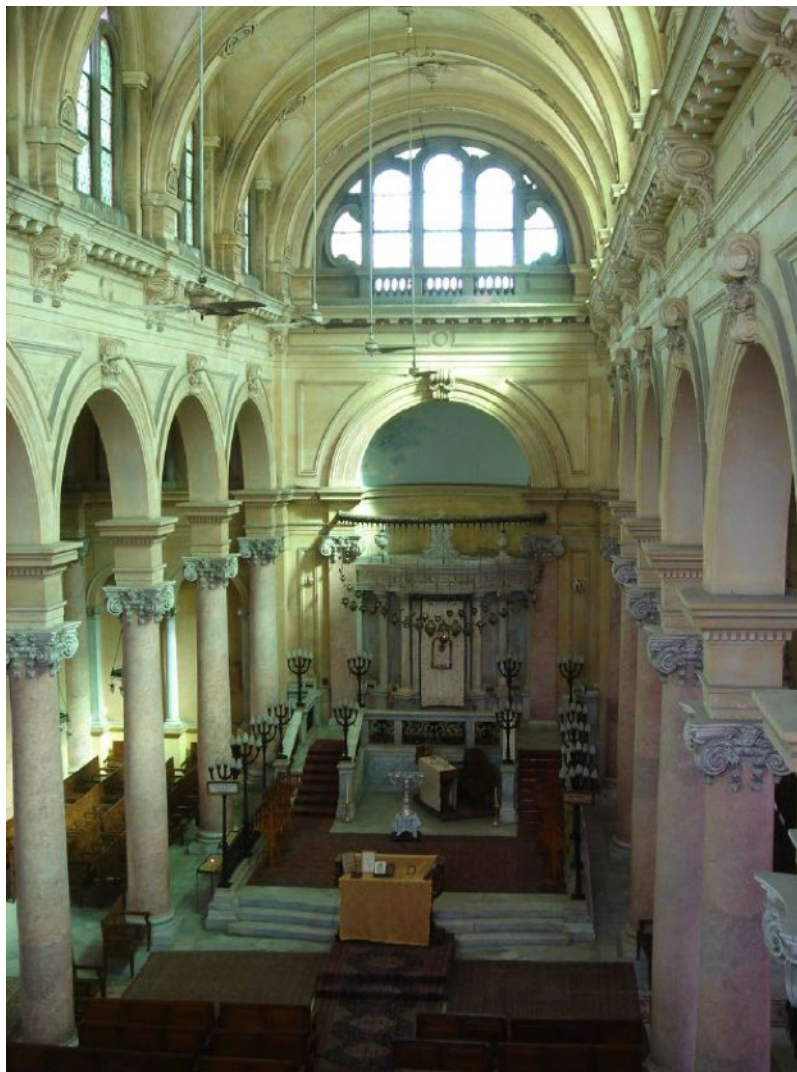
The nave of the Eliahu Hanavi synagogue in Alexandria, Egypt.

benefit the States’ governments and their self-directed property claims over cultural and religious artifacts—at the expense of the ownership rights and basic human rights of individuals in minority populations. They have an especially devastating impact on the countries’ Jewish communities, which were forcibly expelled and their property confiscated by each of these States’ governments in the mid-twentieth century.