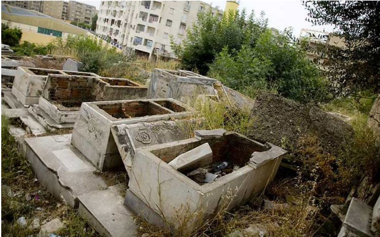
Jewish cemetery at the town of Azzefoun, Algeria, where more than 300 graves were desecrated in 2015. The former Jewish community in the town ceased to exist in the early 1960s when they fled to France. Circa 10/30/2015.

import restrictions, CPAC must find that the request satisfies all four requirements set forth under the law. The requirements are: