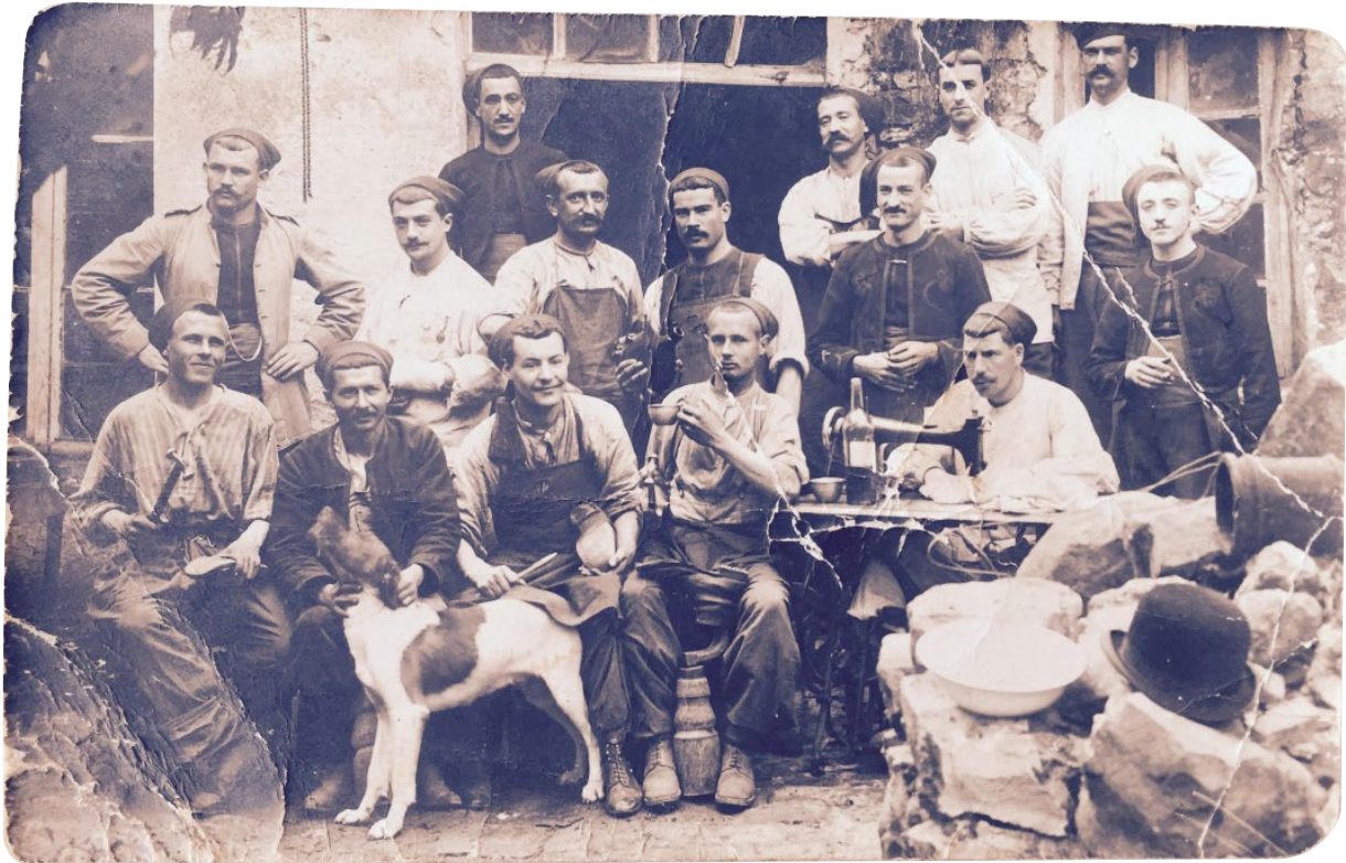
Moise Darmon sewing in a shoe-making workshop in Media, Algeria. Moise, born in 1887, was killed in World War I. Website of Algerian Jewry, http://www.yahadut-algeria.co.il/ .

[89] James Kirchick, The Right to Return , Tablet Magazine, Sept. 2, 2011, http://www.tabletmag.com/jewish-news-and-politics/76721/right-of-return .