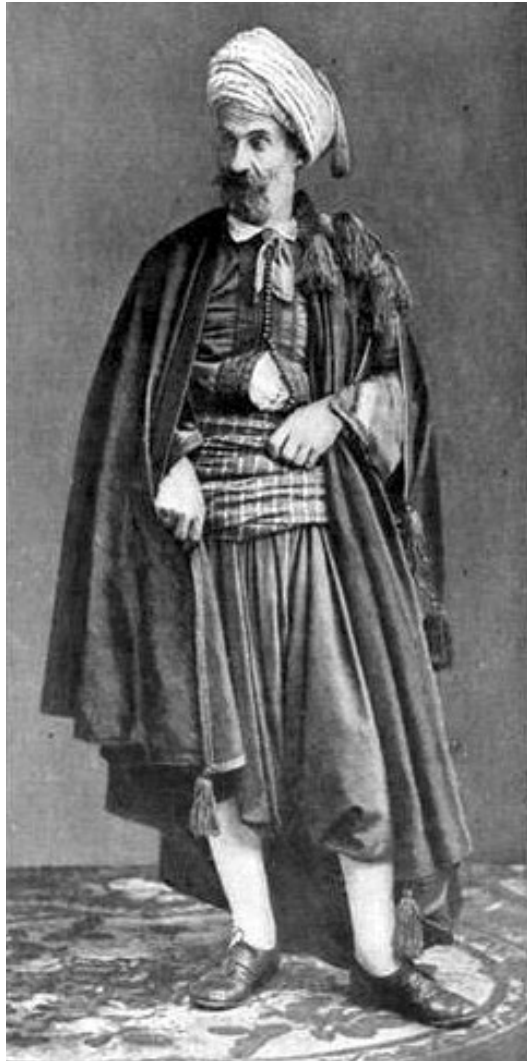
Algerian Jew, 1901-1906