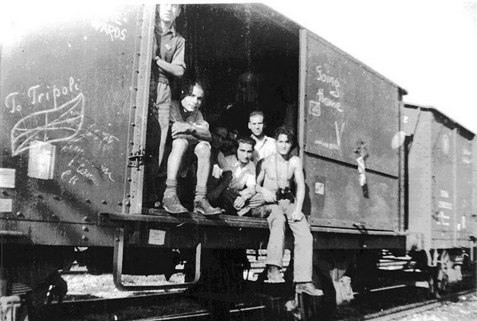
Holocaust survivors returning to Libya from concentration camp Bergen-Belsen.

allegiances to ethnic groups among others.”[33]