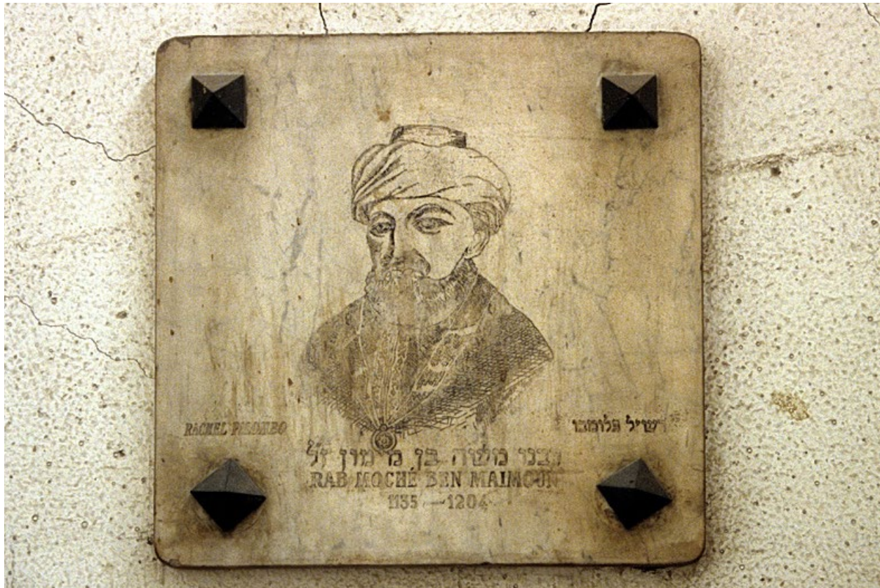
Plaque depicting Moses Maimonides in the synagogue of Moses Maimonides (Moses ben-Maimon), Jewish quarter, el-Muski, Cairo, Egypt, Author Roland Unger, 7 February 2006, Creative Commons Attribution-Share Alike 3.0 Unported license.