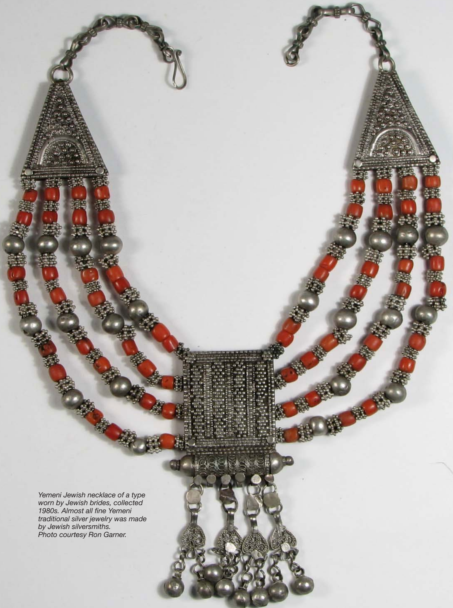
Yemeni Jewish necklace of a type worn by Jewish brides, collected 1980s. Almost all fine Yemeni traditional silver jewelry was made by Jewish silversmiths.