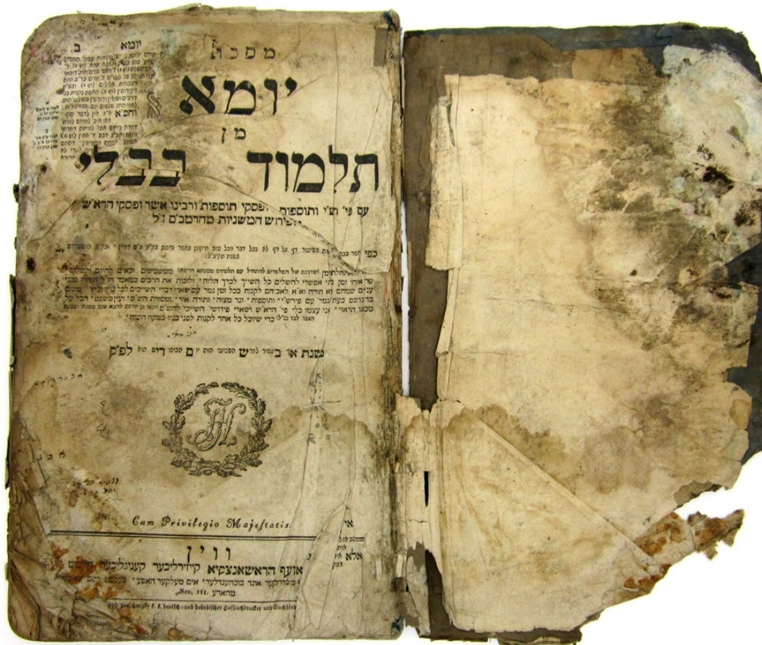
1793 Babylonian Talmud, one of several sacred Jewish texts recovered from the waterlogged basement of Saddam Hussein's intelligence headquarters in 2003 together with tens of thousands of Jewish books, documents, and objects. The items were rescued and brought to the U.S. to be restored.

And all four countries have long and ignominious history of mistreatment of Jewish citizens and their property within that State.[39]