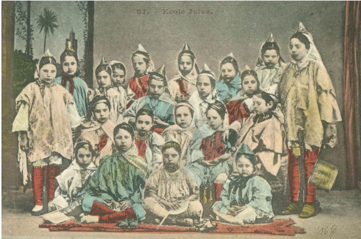
Postcard, Ecole Juive (Jewish School) , North Africa, early 20th century, courtesy Center for Jewish History, New York, NY.

[31] Breten Breytenbach, Cultural interaction , UNESCO Definition of Cultural Rights at 40.