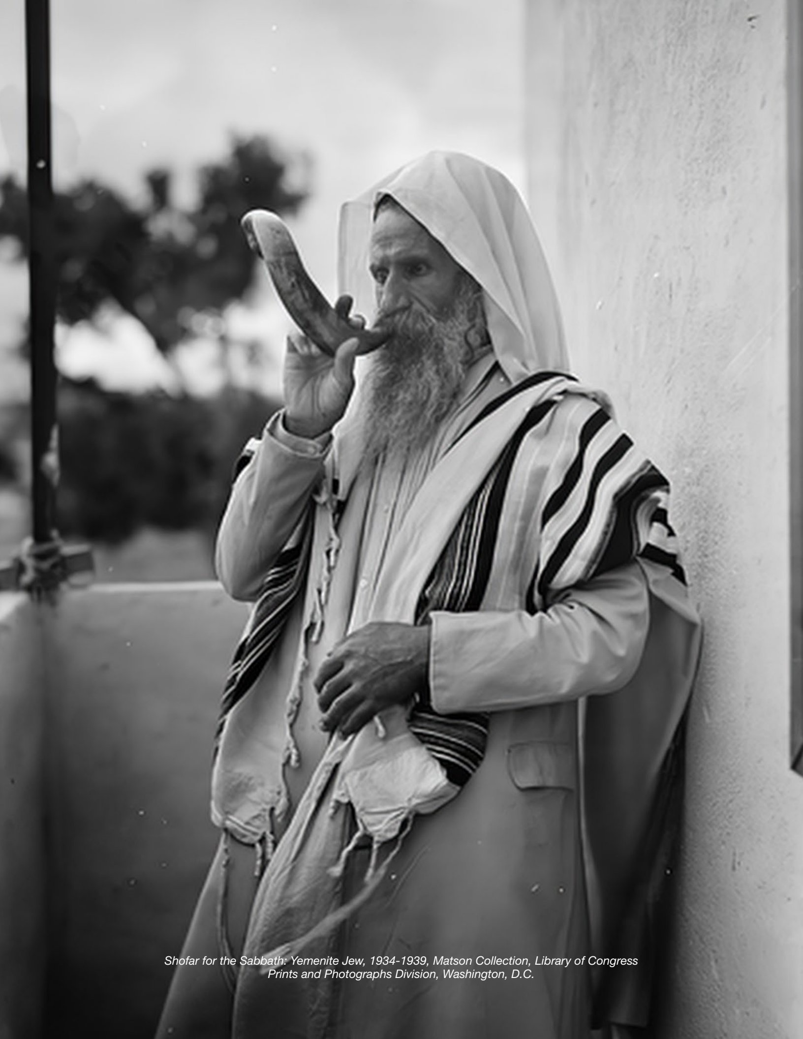
Shofar for the Sabbath: Yemenite Jew, 1934-1939