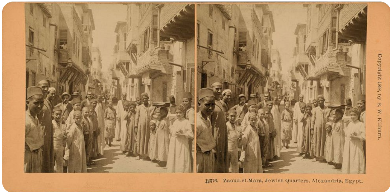
Stereograph, albumen, Zaoud el Mara, Jewish Quarter, Alexandria, Egypt, 1898