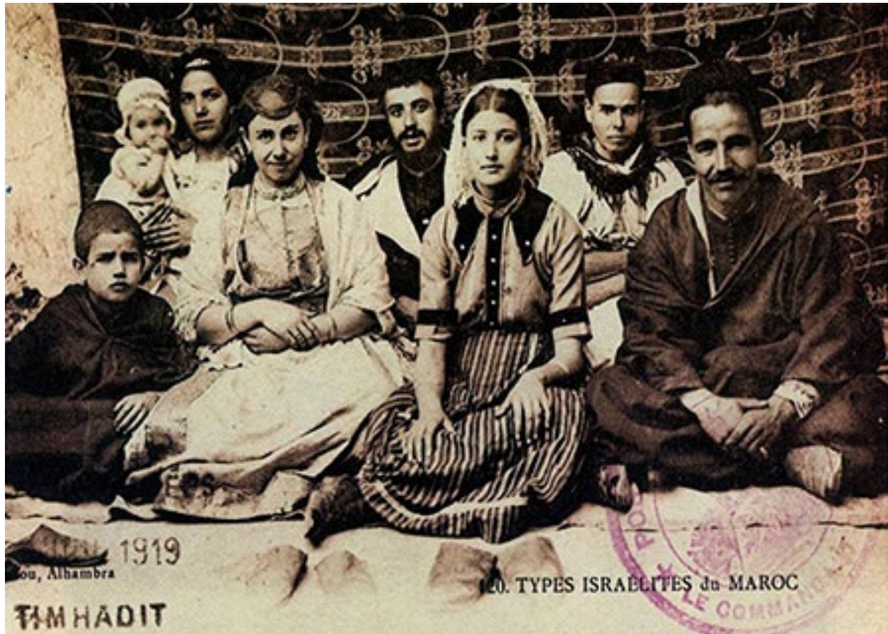
Maghrebi Sephardi Jews, Morocco, circa 1919. Author Unknown. Wikimedia Commons, public domain.