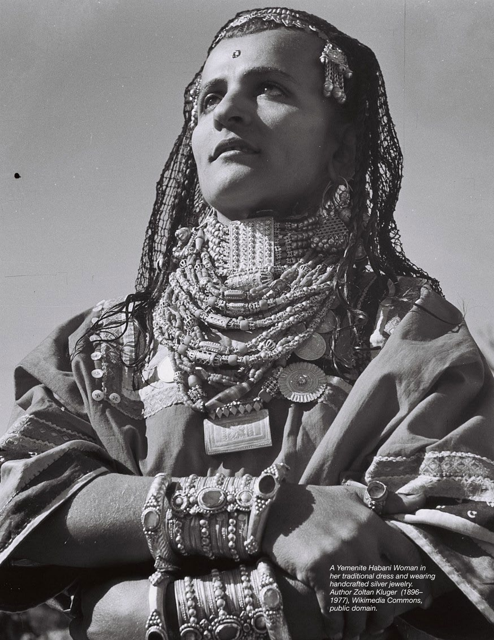
A Yemenite Habani Woman in her traditional dress and wearing handcrafted silver jewelry.