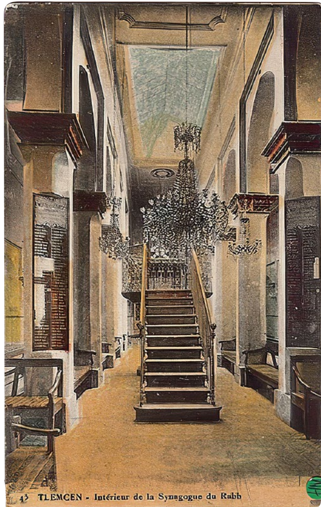
Postcard, Tlemcen, Interior de la Synagogue du Raab.

This museum's remaining ancient assets are documented in detail. The CSAI project[22], a joint Italian -Yemeni