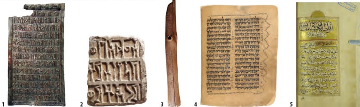
1. Copper alloy plaque, Yemen (Amran), 1 st c. BC-2 nd c. AD (probably), 31.8 x 17.8 x 2 cm.

Ancient alphabet, Arabic or Hebrew writings on stone or metal plates; on wooden sticks; on paper or parchment, with calligraphy or illuminations.