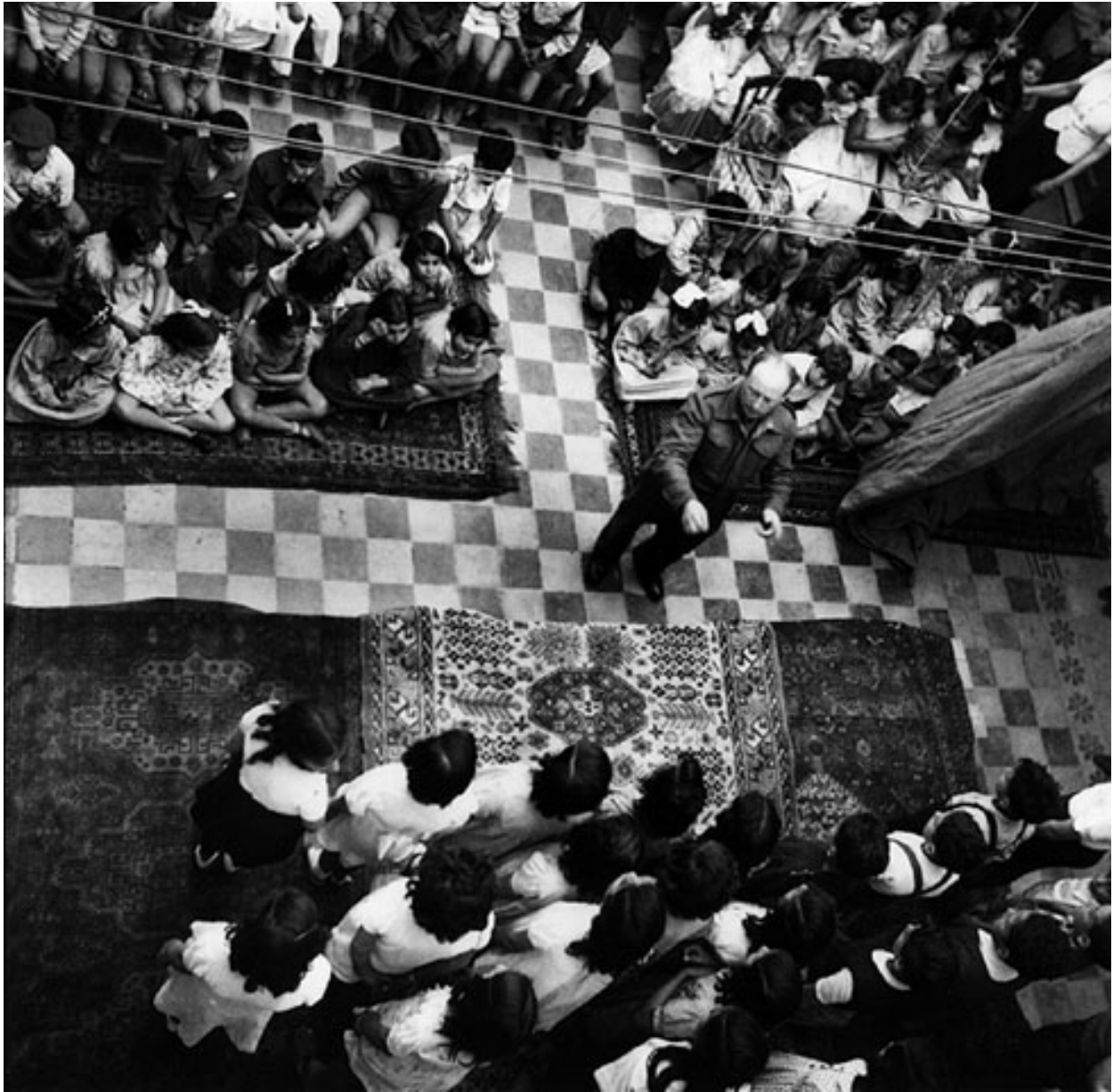
Soldier conducting the choir at the Jewish School in Benghazi, 1944.