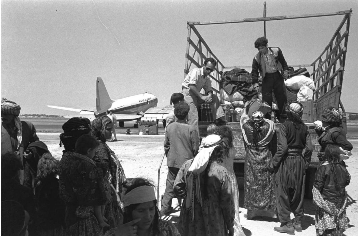
Jewish immigrants departing Yemen via emergency airlift, 1951. Courtesy Israel National Photo Collection. Beit Jagron, Jerusalem, Israel.